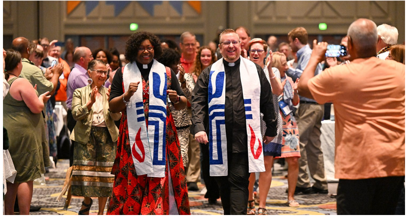
The procession of the newly elected co-moderators during plenary at the 226th General Assembly.