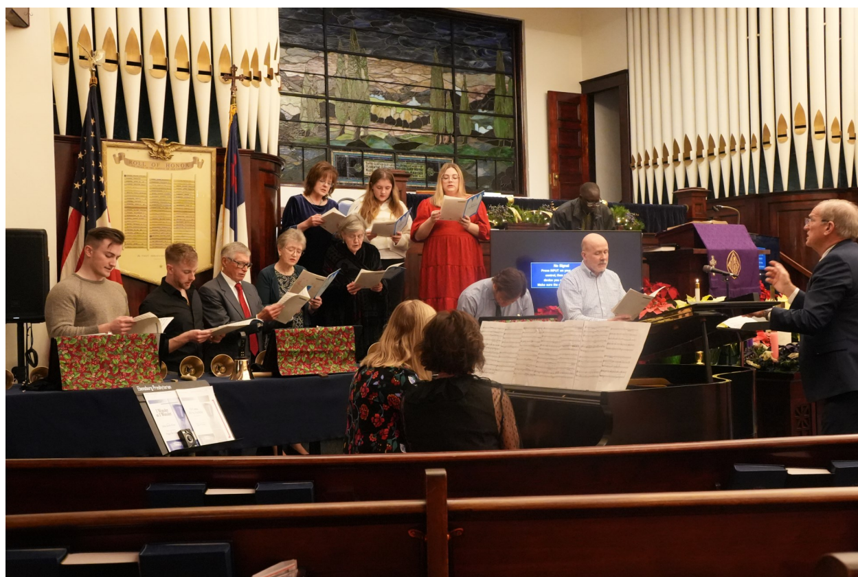
The choir practices for Christmas Eve.