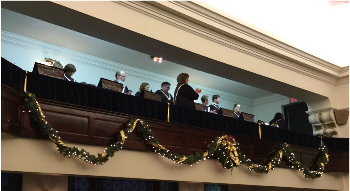
3rd Annual Christmas Organ Recital December 1, 2018